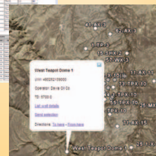
Details displayed from a well selected in Google Earth via a dynamic query to the OpenSpirit Web Server.

OpenSpirit Corporation Headquarters 4800 Sugar Grove Blvd., Suite 500 Stafford, Texas USA 77477 Phone: +1 281 295 1400